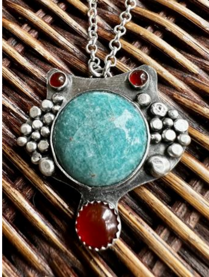
Medium Image #2