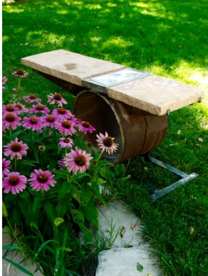
Medium Image #2