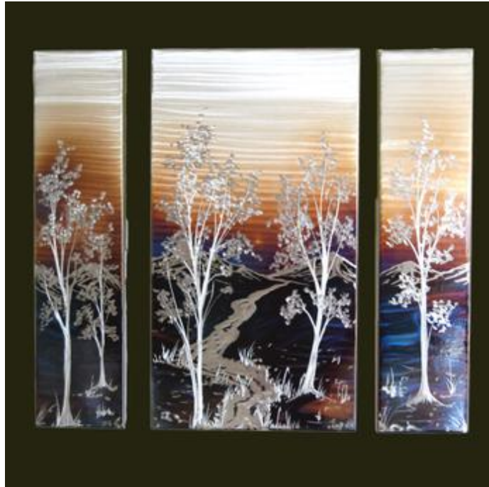
Medium Image #2