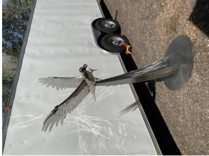
Medium Image #2