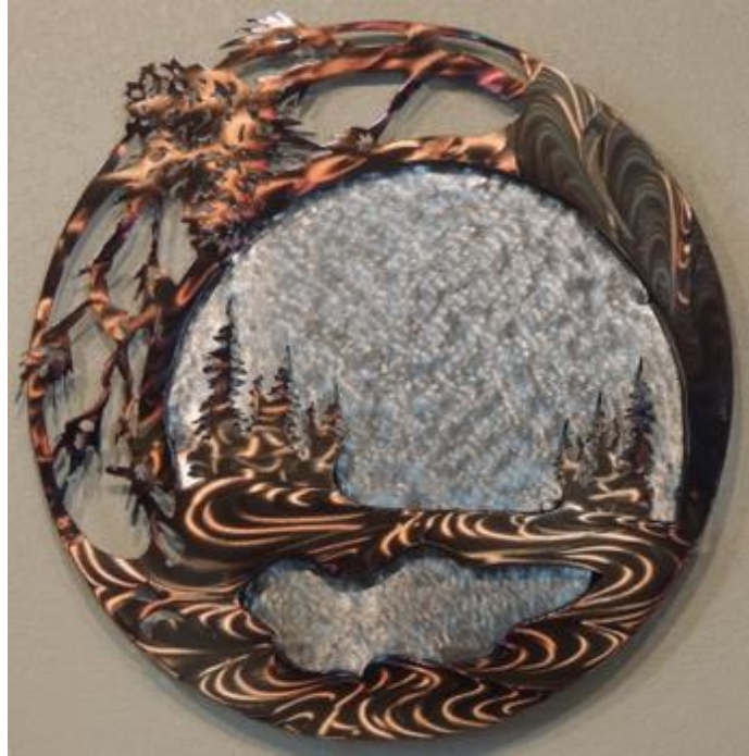
Medium Image #2