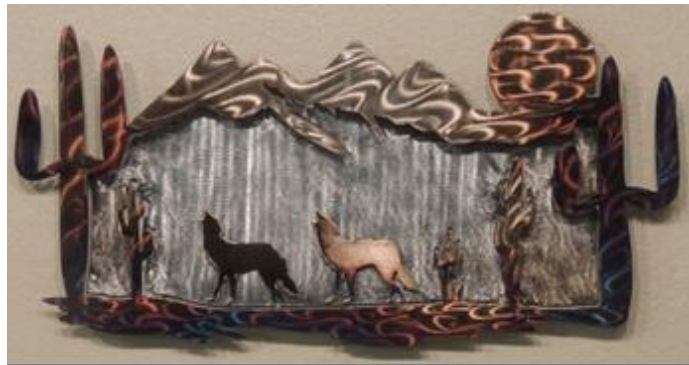
Medium Image #3