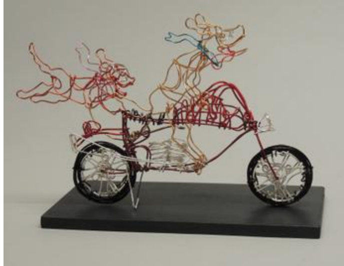
Medium Image #2